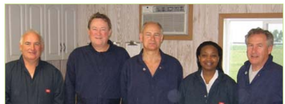
Spring Point Project board members and Minneapolis staff visit the RMU