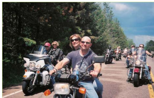
Riders take to the road for a cure