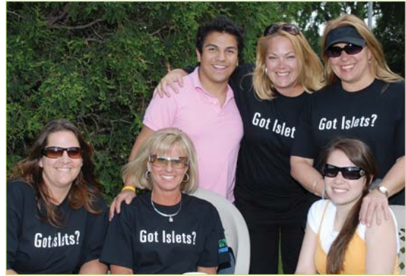
"Got Islets" volunteers