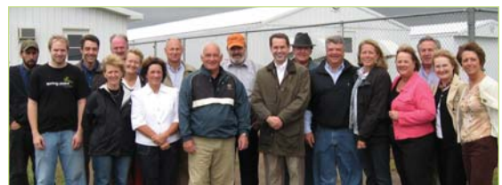
Board members, staff, and their spouses enjoy the day

The board went home after a very productive day and were most grateful to their hosts at the Colony for the warm welcome.