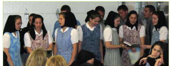
Riverside Colony choir performs at BBQ get-together

On June 11, 2008, the Hutterian Brethren Riverside Colony in South Dakota hosted our board of directors meeting. This very special place was the site of our first animal facility, the Riverside Multiplier Unit (RMU) founded nearly four years ago. Offspring of those first animals were brought to the Diabetes Research and Wellness Foundation (DRWF) Islet Resource Facility, where they were bred and maintained to serve as donors for transplantation.